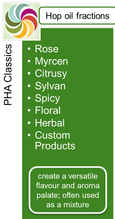
Figure 1: Range of PHA® products

PHA® Classic products are prepared from cone hops by specific extraction and distillation methods. They consist of original hop oil compounds in a propylene glycol (PG) solution. PG is a permitted carrier for flavours as per regulation 2006/52/EC. PHA® products are exclusively supplied worldwide by the Barth-Haas Group.